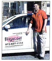
Hardyston man's painting business is primed to celebrate its third year.